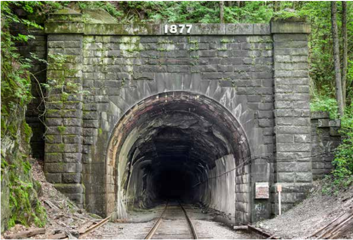
East Portal of the Hoosac Tunnel, Florida, Massachusetts. Photograph by Shaun O'Boyle