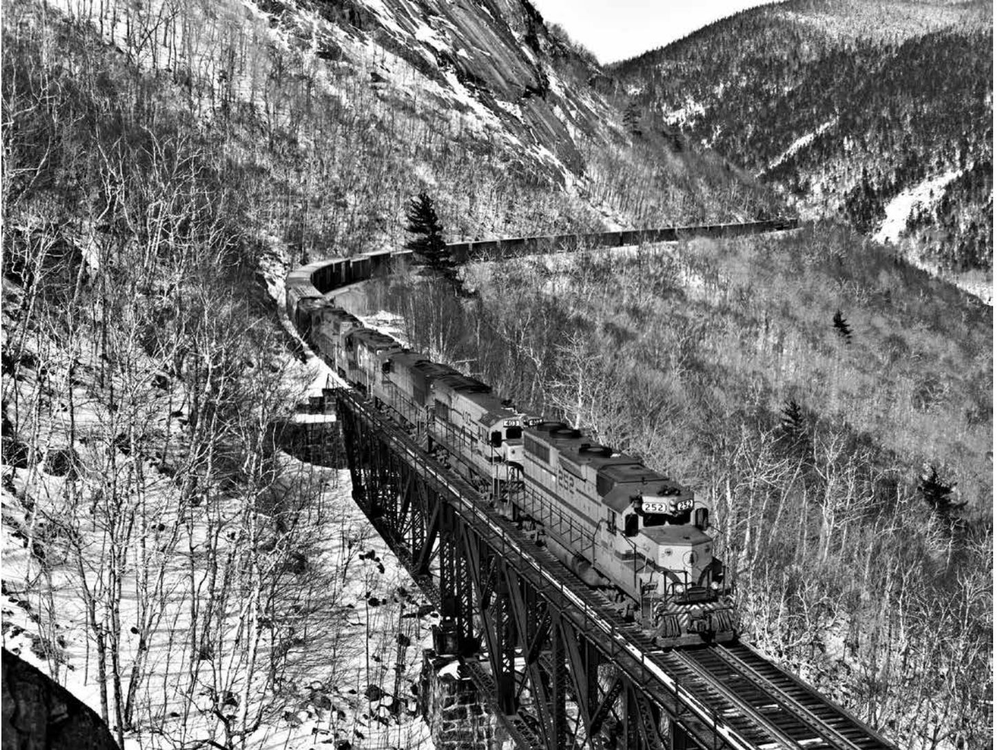
Guilford Transportation's daily southbound freight train crosses Willey Brook Bridge in New Hampshire's White Mountains on March 30, 1983. This line was the Maine Central's Mountain Division over Crawford Notch, which Guilford purchased in 1981.