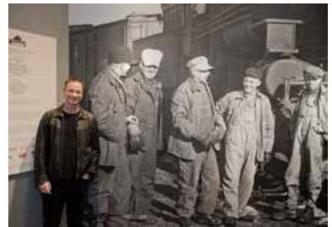
The Center's biggest project is Railroaders: Jack Delano's Homefront Photography , a collaborative exhibition with the Chicago History Museum that opened in April 2014 and closed in January 2016. Its twenty-one-month was the longest-ever for a temporary exhibition at the museum. Among its record-setting 500,000 visitors were Gary Sinise, the famous actor, whose grandfather was an Indiana Harbor Belt conductor and featured extensively.