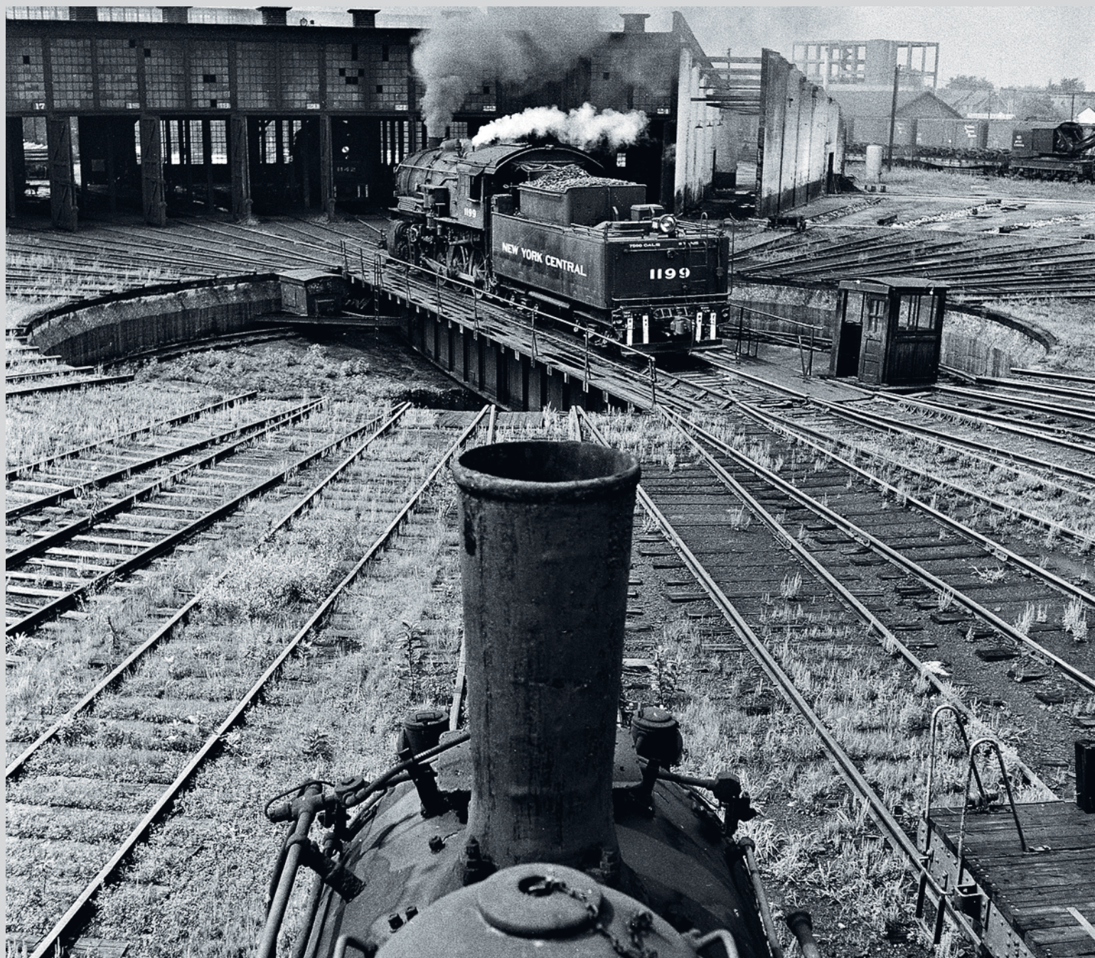
Above: New York Central 4-6-0 no. 1199 on the turntable in St. Thomas, Ontario, in 1956.