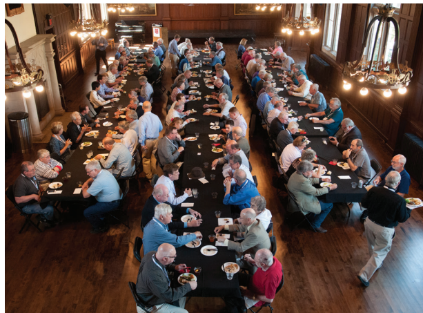
Attendees enjoy lunch in Calvin Durand Hall on Saturday. CRP&A Conversations 2019