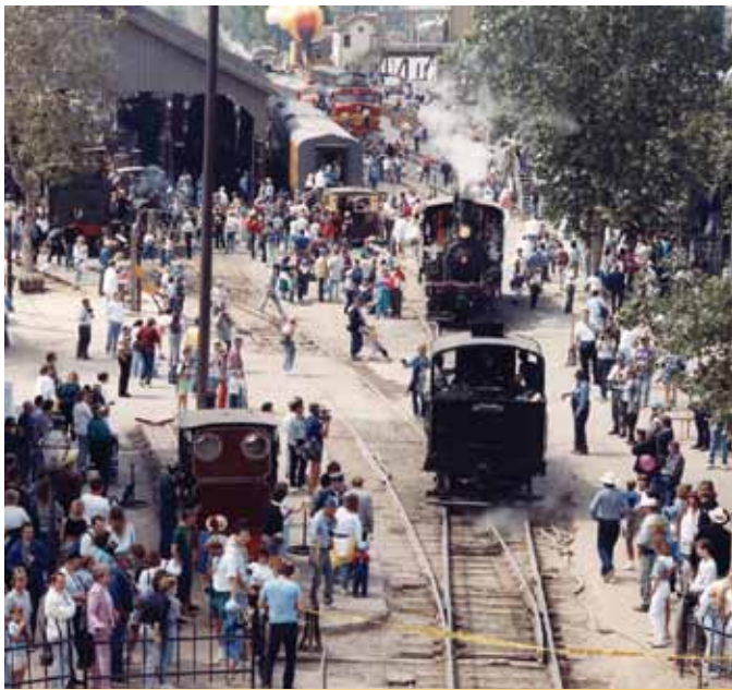
Visitors enjoy the sights and sounds at Railfair.

News of the 1848 discovery of gold in nearby Coloma (site of Sutter's Mill and today home to Marshall Gold Discovery State Historic Park) traveled quickly around the world, drawing thousands of people to the Sierra Nevada foothills.