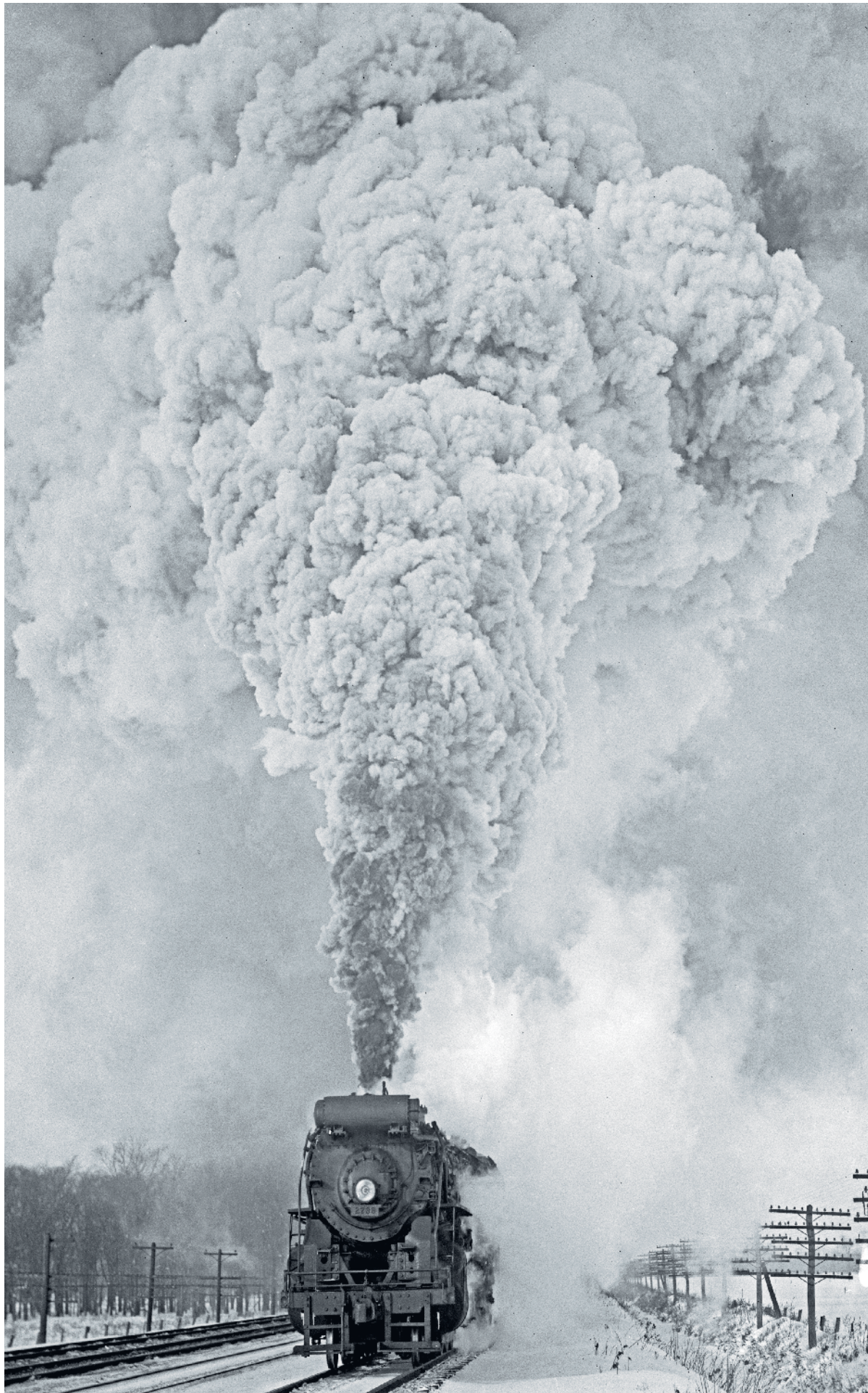
Left: New York Central Railroad L-2a class 4-8-2 steam locomotive no. 2739 sends an eruption of steam and smoke into the winter sky as it powers a train down the railroad's four-track main line sometime around 1950.