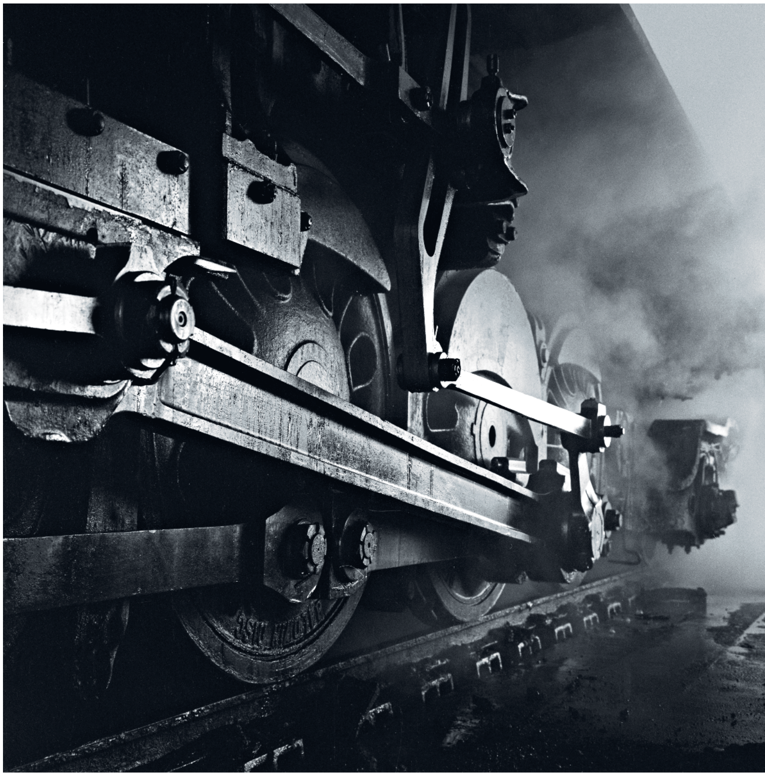
Rods and wheels of National Railways of Mexico 2-8-4 steam locomotive no. 3354. Rose-01-079-11