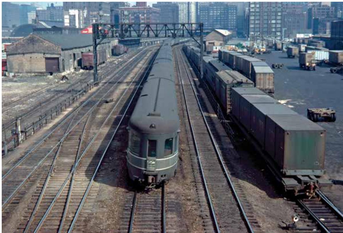
Left: New York Central train no. 25, the westbound 20th Century Limited , arriving at Chicago's La Salle Street Station in April of 1967.