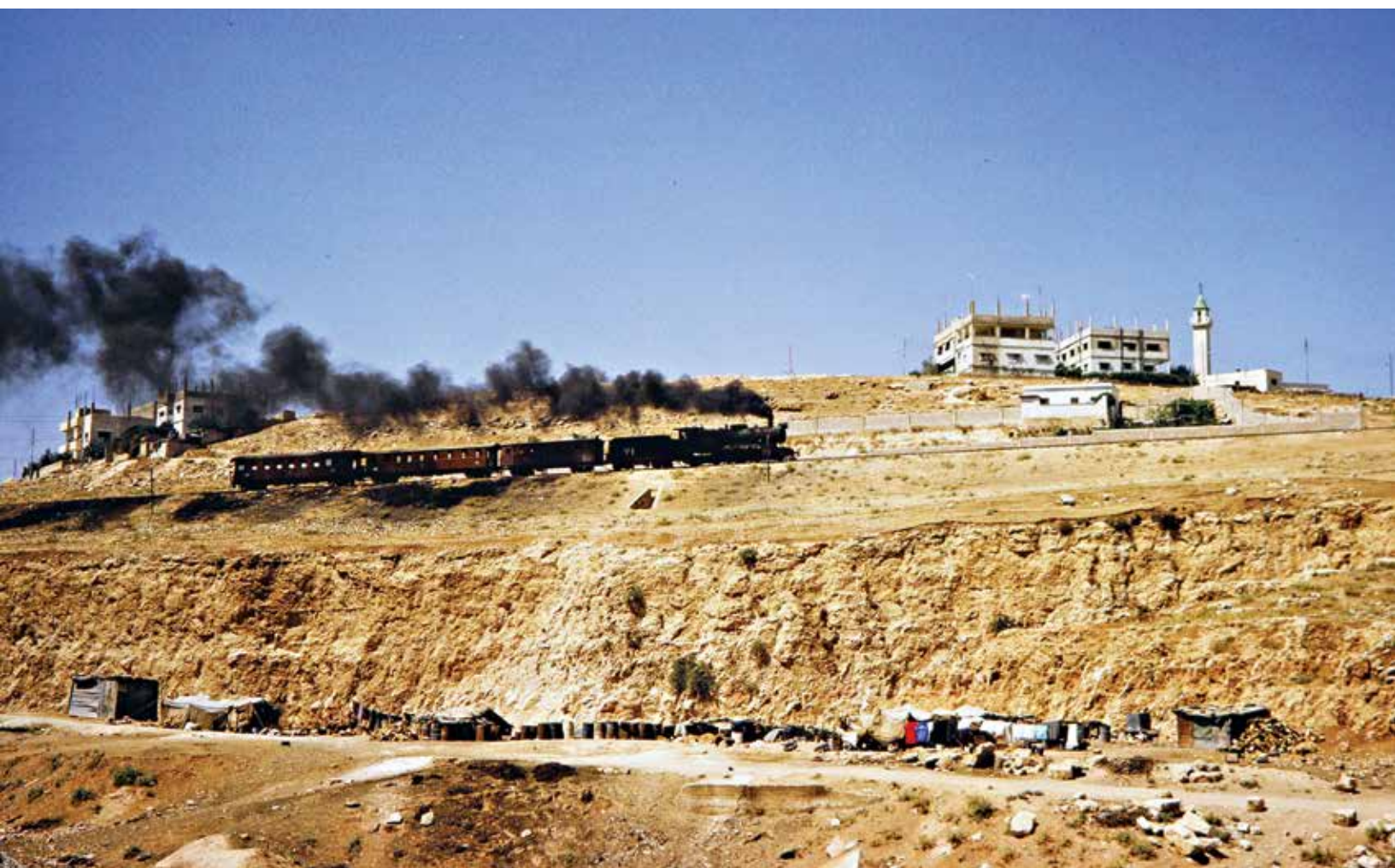
Below: Hedjaz Jordan Railway 2-8-2 steam locomotive no. 71 pulling a three-car train upgrade near Amman, Jordan, on July 15, 1991.